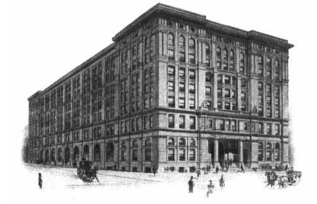
THE PHILADELPHIA BOURSE.

will be interested in knowing somewhat about the new location and environment of the