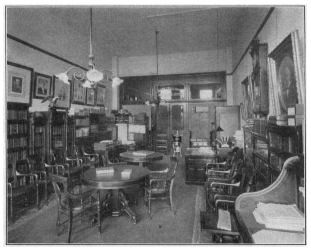
OFFICE OF THE JOURNAL OF THE AMERICAN PHARMACEUTICAL ASSOCIATION.

The Philadelphia Bourse occupies a large and imposing building in the heart of the